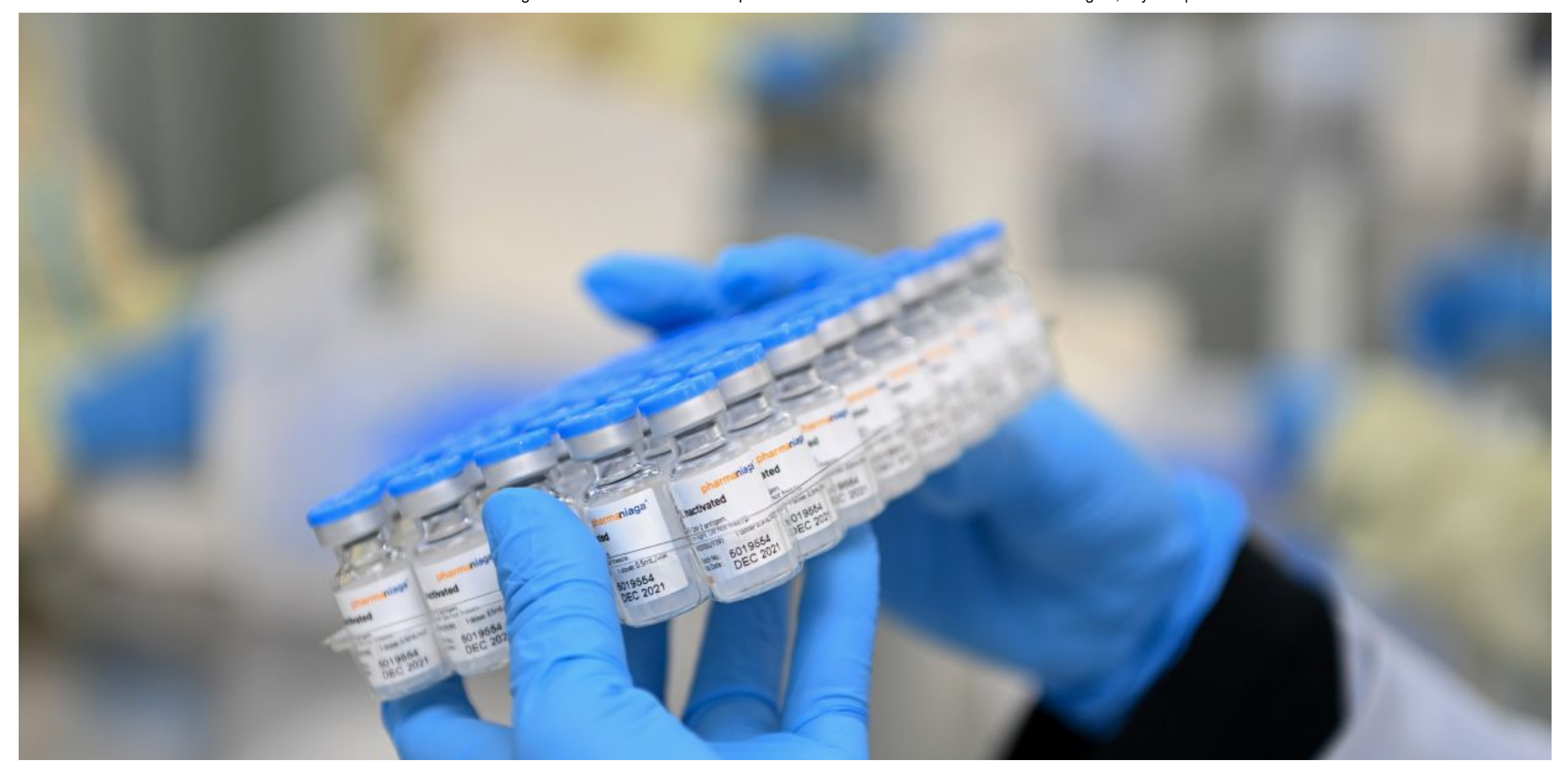
PUTRAJAYA: Pharmaniaga Bhd is allowed to sell its Sinovac vaccine in the open market as it has fulfilled its commitment to the government, says Khairy Jamaluddin.

He also cleared the air over the perception that the government had pulled Sinovac out of the national immunisation programme. Privacy - Terms Home For You Bookmark Audio Privacy - Terms Search